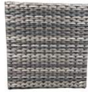
C 1PC Ottoman Top