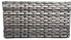
B 2PC Side Panel