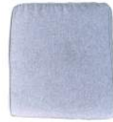
D 1PC Cushion